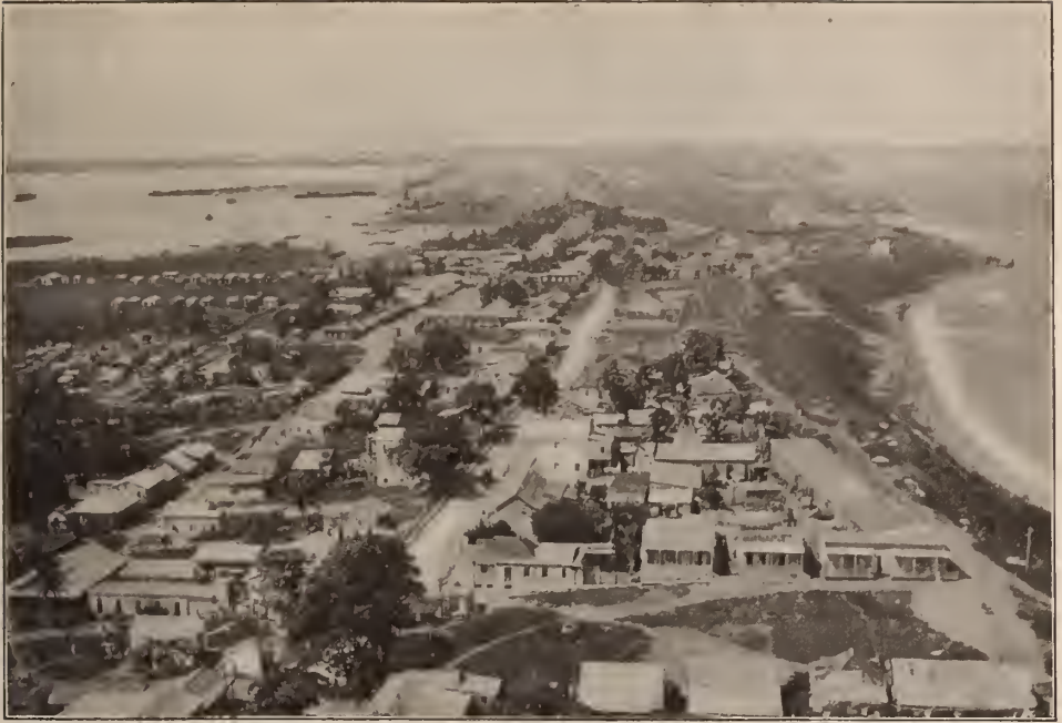
A VIEW OF SAN JUAN, PORTO RICO

From the wireless station, east of the city proper. This view is looking directly toward the Mors at the entrance to the harbor